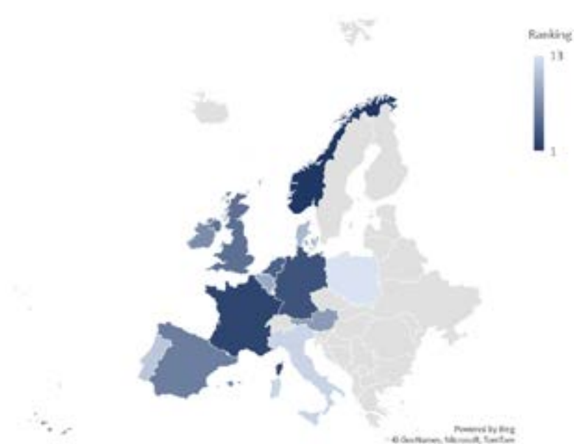
Figure 1 – EV Country Attractiveness heatmap:

Over the past decade electric vehicles (EVs) have become increasingly popular across many of the world's major economies, with both the eco-conscious and average consumer adding to the rise in sales. This phenomenon has not just appeared from thin air, however, as international climate agreements, national net zero plans, EV incentives and ICE (internal combustion engine) vehicle disincentives have all given rise to investment and factored into any significant change in uptake. Cornwall Insight have partnered with law firm Shoosmiths to create the Electric Vehicle Country Attractiveness (EVCA) Index, a ranking which charts the relative attractiveness of major European nations for investment in EVs – with a particular focus on passenger cars – and EV charging infrastructure. We have identified a variety of metrics covering a range of factors (from purchase subsidies to national EV charging targets) upon which nations can be ranked accurately on their attractiveness to investors. Highlighted on the map and table below are the rankings – with 1 being the highest and 13 the lowest – followed by a discussion of current EV markets.